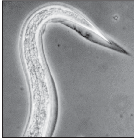
A nematode, highly magnified.