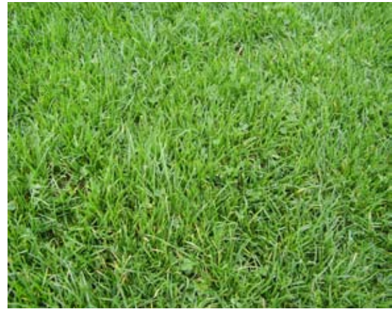
Portland Parks and Recreation tolerates some clover in turf in Arbor Lodge Park, a pesticide-free park in Portland.