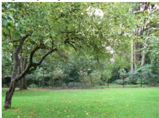
Mode 2 Level B turf in Scobert Gardens, a pesticide-free park in Eugene. “Level B” indicates that the frequency of cultural maintenance is lower than for other Mode 2 turf.

When asked about washing mowers between cuttings to reduce weed seed spreading, Hallett remarked, “Though this practice would be ideal in a more centralized operation, for example golf courses, our operation is spread throughout the city. Logistically, this practice would be unfeasible.” 2