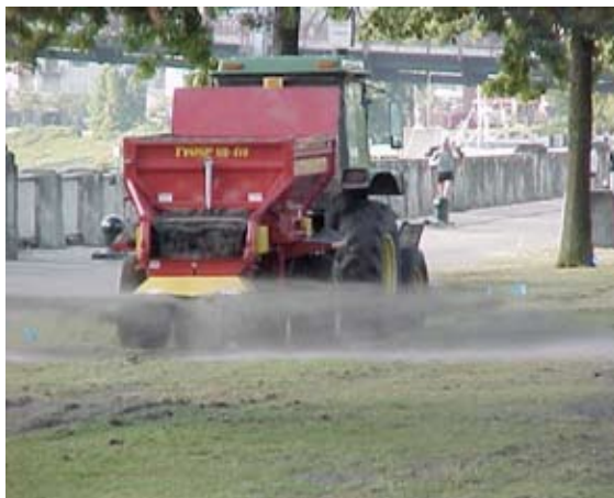
Top dresser used to apply sand or similar material.

"This is a very labor intensive and costly maintenance activity but one that is essential if Portland Parks is going to improve the safety and playability of our sportsfields," says Carr.