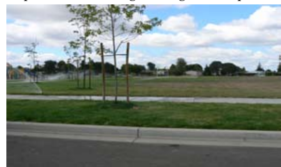
Candlelight Park is irrigated in some parts of the park and not others because of budgetary constraints.

Planning is key. After Eugene’s Candlelight Park was constructed, for example, a budgetary limitation resulted in the decision to irrigate some parts of the park and not others. Even so, the same grasses were planted in all areas of the park. Knowing in advance of construction which areas will be irrigated can be helpful in determining which grasses to plant.