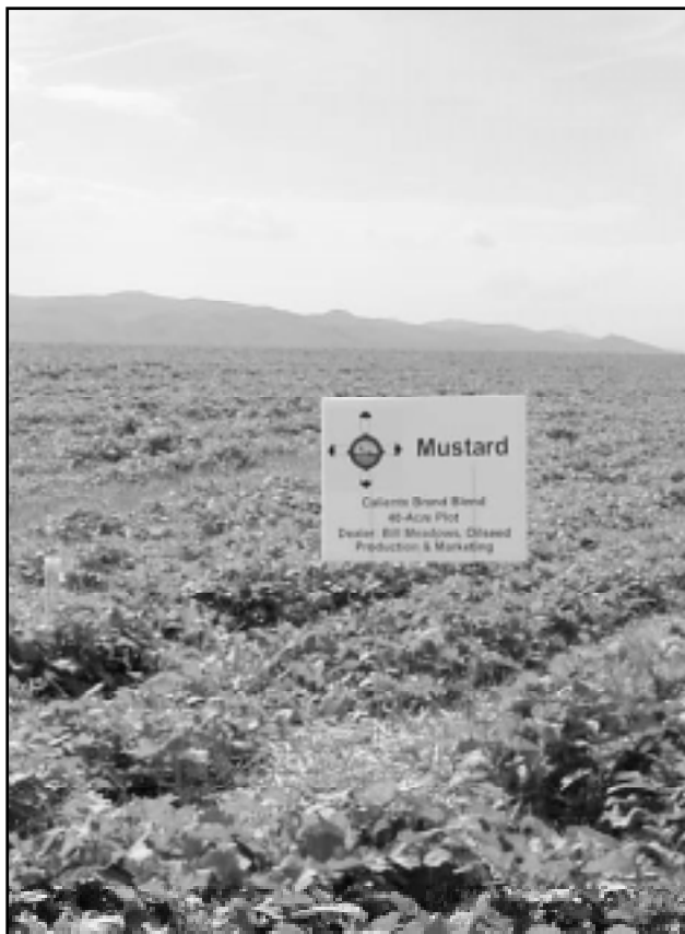
A demonstration plot testing alternative potato crop rotations to reduce pesticide use.